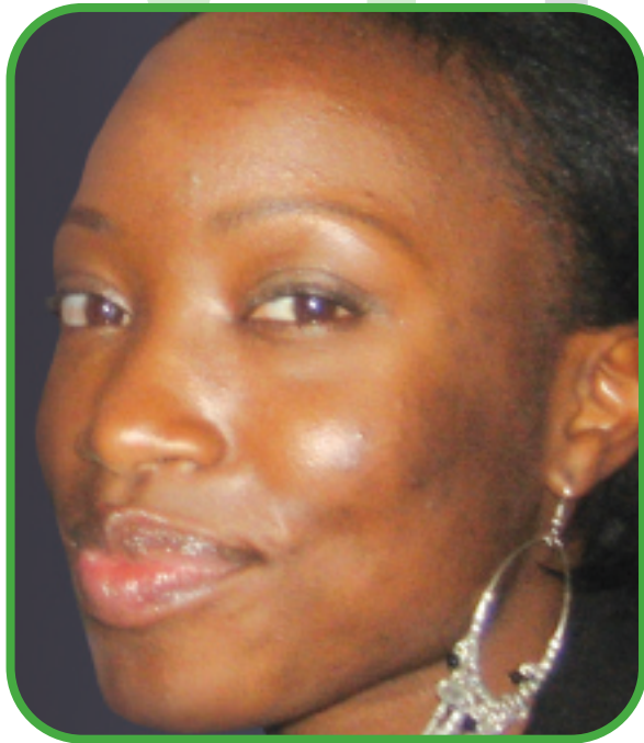
Before the Peel